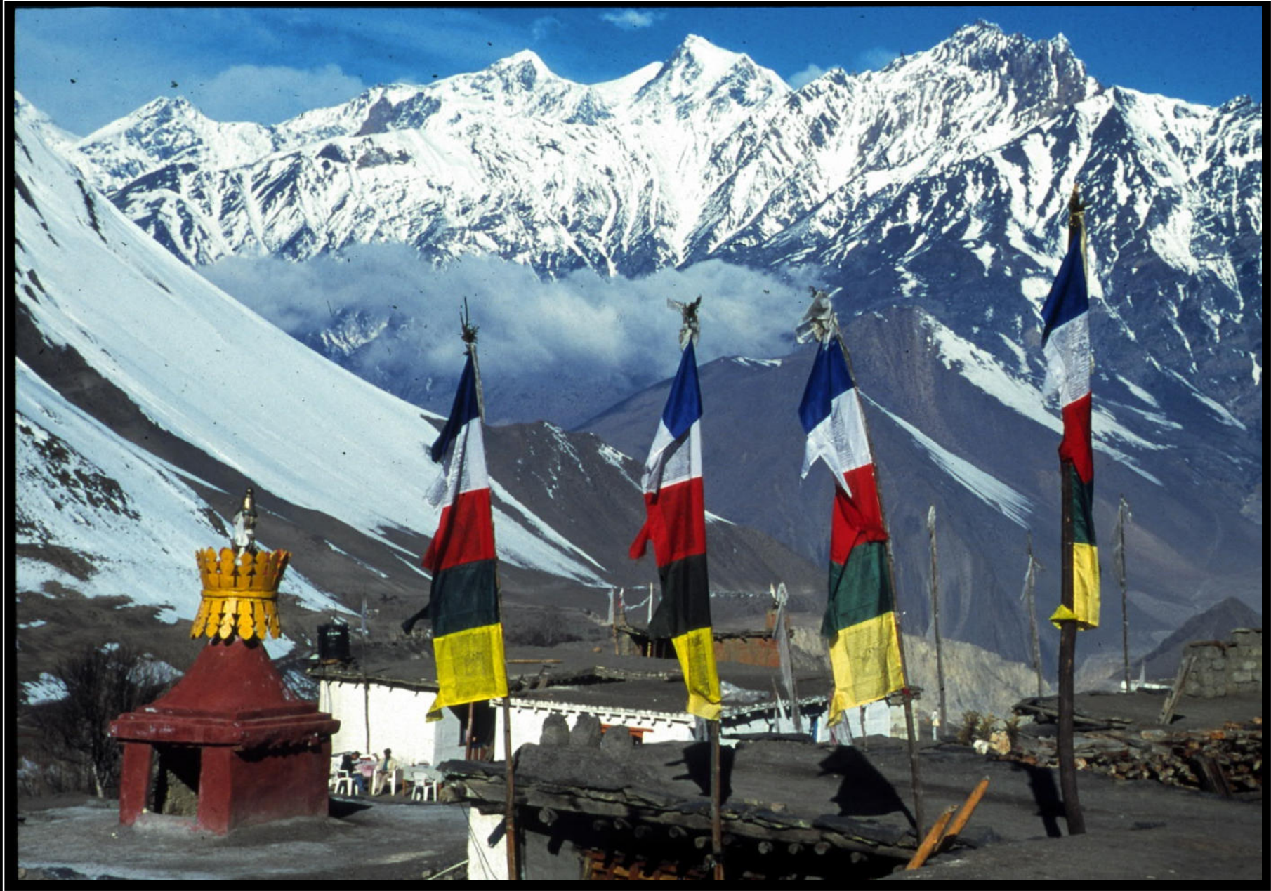
© Welcome to Nepal - Land of the Gods. Land of the Mountains. Land of the Natural Wonders. © View from our guesthouse terrace on prayer flags and local peaks of Jarkoth (3.612 m) towards the direction of Mustang – March 1998